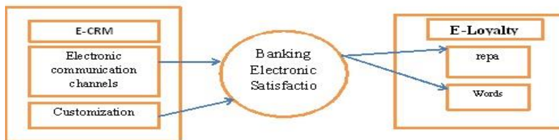
Figure 1. Proposed research framework

Notes: E-CRM=Electronic customer relationship management, repa= intentions to repeat e-dealing,, Words= words of mouth.