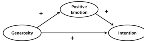
Figure 2. Proposed Model Relationship of Generosity to Intention

P2: Generosity has a positive direct influence on intention.