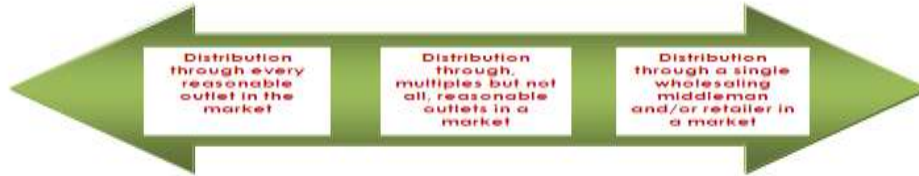
Figure 1: The intensity-of-distribution Continuum

To reach small retailers, producers often use agent middlemen, who in turn call on Whole salers that sell to large retail chains/or small retail store. After designing a channel, next thing that firms must consider is, on the intensity of distribution which means how middlemen will be used at the wholesale and retail level in a particular territory (Etzel et al., 2004). In accordance with Etzel et al., (2004), there are three degrees of intensity.